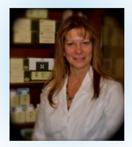
Treatments, Steps of Care

Monday, Wednesday, Friday: 8am – 6pm Tuesday, Thursday: 2 pm – 7 pm Saturdays: Apt only call 480.201.6744